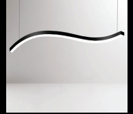
FUGA 2 CURVE SP