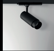
POTIS D FOCUS S.S.LED