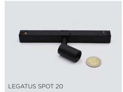
LEGATUS SPOT 20

track profiles to give the maximum flexibility to lighting projects. All the tracks have the same "smart core" with integrated DATABUS for light control, that makes it technically at the cutting edge. Creativity should not be limited through situations. BR//GHT configures your lighting solution exactly to your needs and wishes.