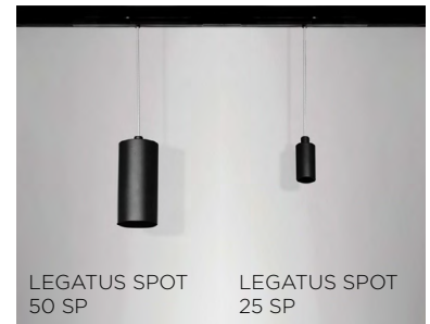
LEGATUS SPOT 50 SP