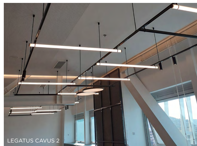
LEGATUS CAVUS 2

the need of any tools. Different types of connection modules and luminaires which provide maximum flexibility in projects that run along walls, ceilings, or a combination of both. The New MICRO low-voltage Magnetic track born of necessity to miniaturize components and infrastructure. A great focus has been placed on the dimensions, that are greatly reduced. Resulting in a product that can make a difference in lighting projects where aesthetics and attention to detail are fundamental. MICRO range offers different