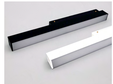
LEGATUS SPOT 25 SP