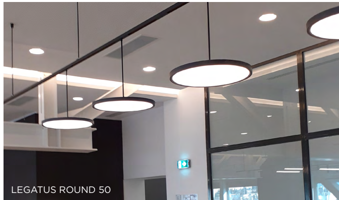
LEGATUS ROUND 50

Magnetic 48V Track System is a flexible system to design lighting. Can be installed recessed, Trimless, Surface mounted or suspended. Extruded Aluminium TrackLights and linear light System equipped with latest LED technology connects and powers its LED luminaires via a magnetic core. 48V low voltage track system with magnetic fixation, equipped with dimming function of DALI, as well as ON/ OFF. With the magnetic fixation, all modules can be installed, repositioned and switched in the profile easily, without