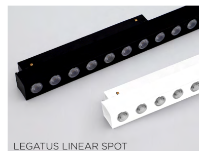
LEGATUS LINEAR SPOT