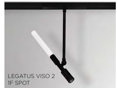
LEGATUS VISO 2 1F SPOT