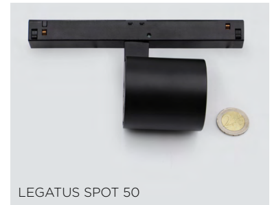
LEGATUS SPOT 50